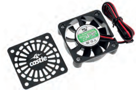
CC-011-0015-00 Replacement Fan for Mamba XL2 and Edge HV F160 ESC