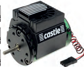
CC-011-0001-00 CC Blower Fan Shroud for 1400 series motors