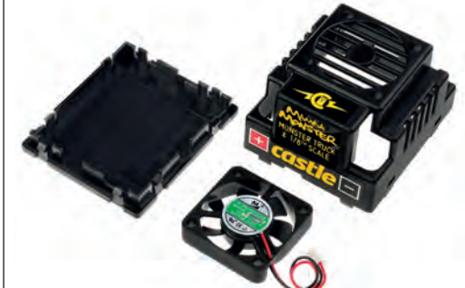
CC-011-0001-00 Replacement Housing with Fan for Mamba Monster ESC