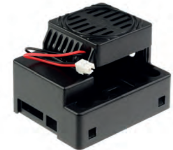
CC-011-0015-00 Replacement Housing with Fan for MambaMax Pro ESC