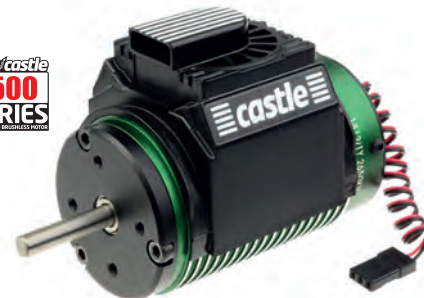
CC-011-0004-00 CC Blower Fan Shroud for 1500 series motors